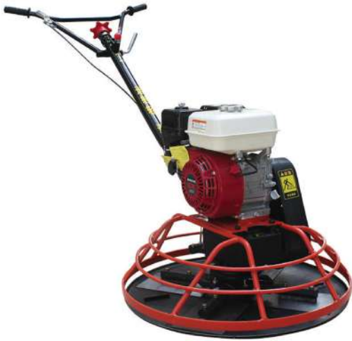
GX 160 HONDA ECONOMIC MODEL