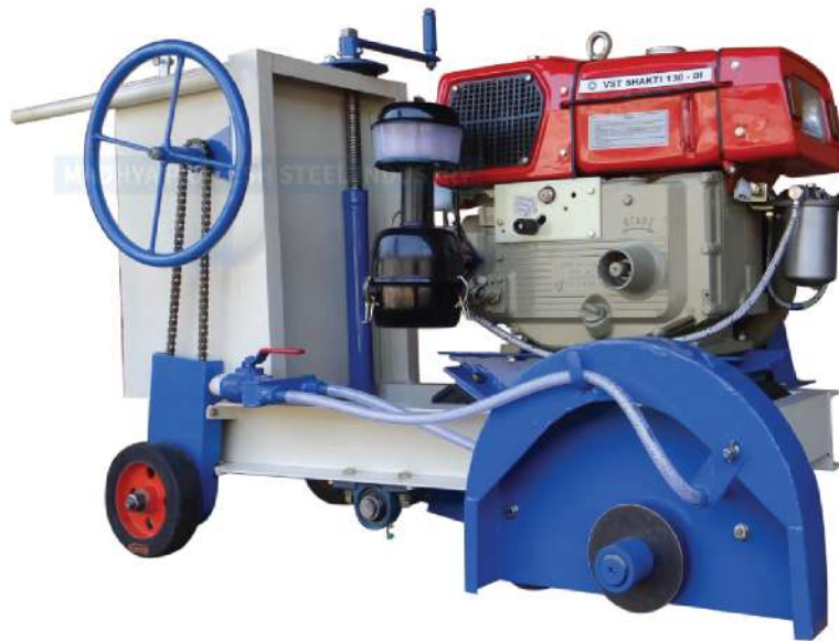
HM 225D Groove Cutter 13hp VST Diesel Engine