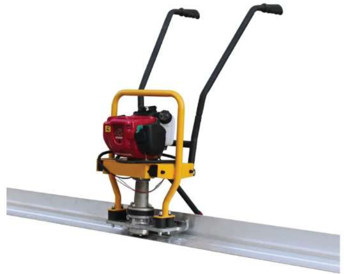
HM - Bullfloat Surface Screed (Manual)