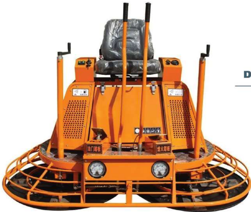
RIDE ON TROWEL