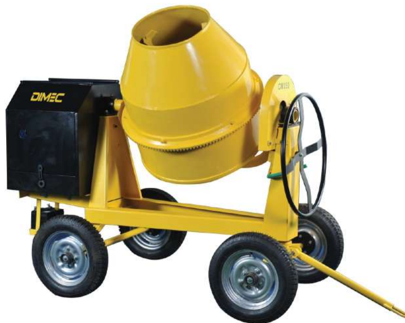
HMS 230L Trolley with Engine