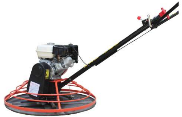
DOUBLE SPEED ELECTRIC