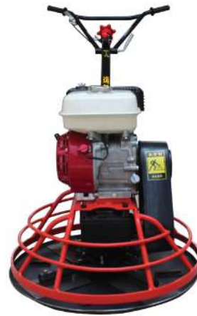
POWER TROWEL / FLOATER 600MM HONDA GX 160