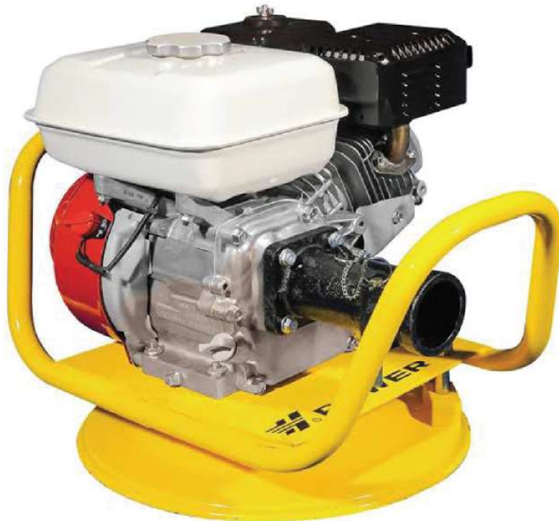
Honda GX 160

Note: Actual product might differ in appearance.