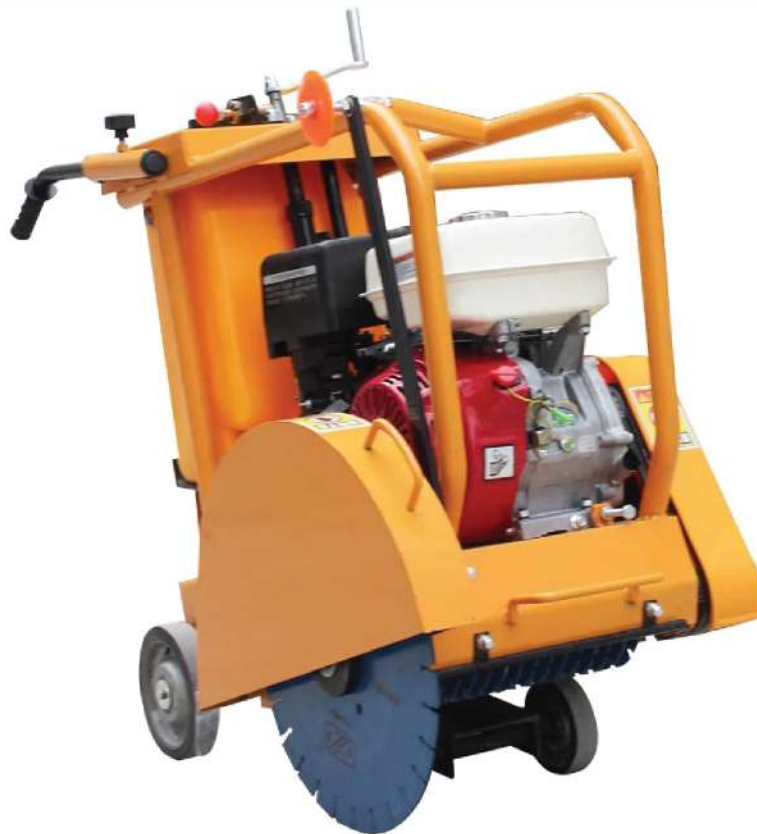
HM 150P Groove Cutter