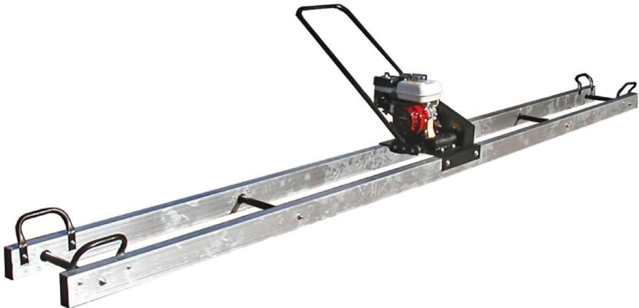
HM - Double Beam Screen Vibrator (Electric Shutter / Motor Driven)

Note: Actual product might differ in appearance.