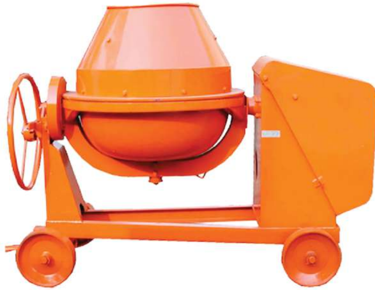
HMS 200 L Tilting Type